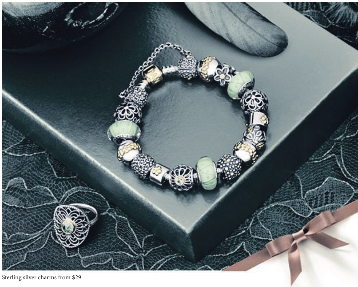
Sterling silver charms from $29