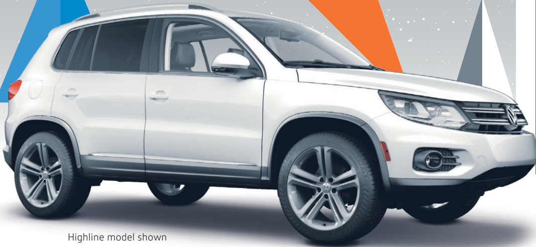
Highline model shown

Winter is no match for 4MOTION® All-Wheel Drive.*