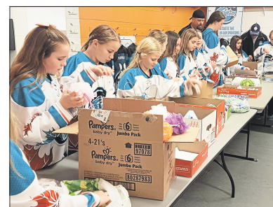
North Halton peewee BB photo