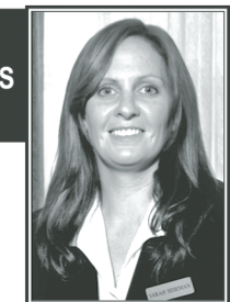
Licensed Funeral Director Sales Representative Shelburne Memorials