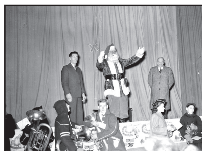
Roxy Christmas Party 1948