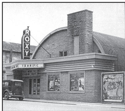
The Acton Roxy 1955