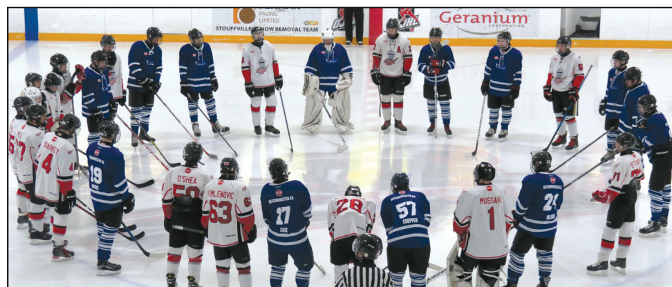
The Pee wee, Bantam (King), Minor Midget and Midget Select teams participated in the Stouffville Year Ender Bender Tournament. The Midgets won the finals 4 to 0 over Ajax, and The Bantams won 4 to 3 over Halton Hills Thunder. Before their games, both the Bantam and Midget teams had a moment of silence for the Humboldt Broncos hockey team.