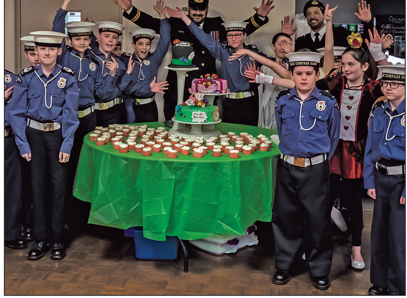
TEA PARTY: The Navy League Cadet Corps—Compass Rose held their annual Mad Hatter's Tea Party last Saturday afternoon at the Royal Canadian Legion Branch 197. The Tea Party is one of the Cadets' largest fundraisers with proceeds going to support the Cadets' programs and activities throughout the year.

One adult and one young offender, who cannot be named under the provisions of the Youth Criminal Justice Act, are facing three counts of theft under.