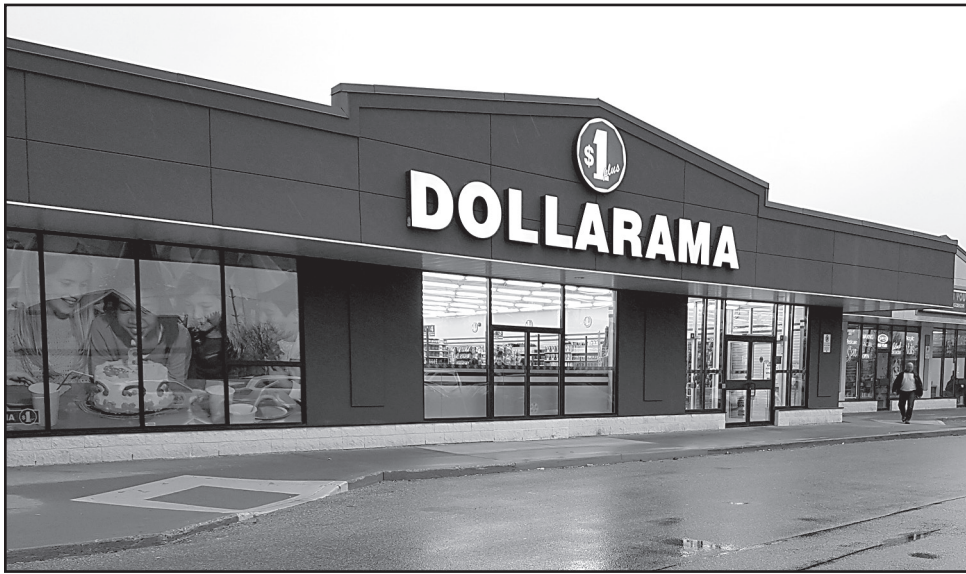
NEW STORE: Acton's new Dollarama opened last Wednesday, March 28 in the Market Place Plaza at 372 Queen Street.