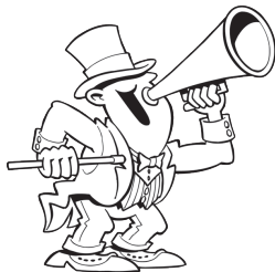
with Vivien Fleisher