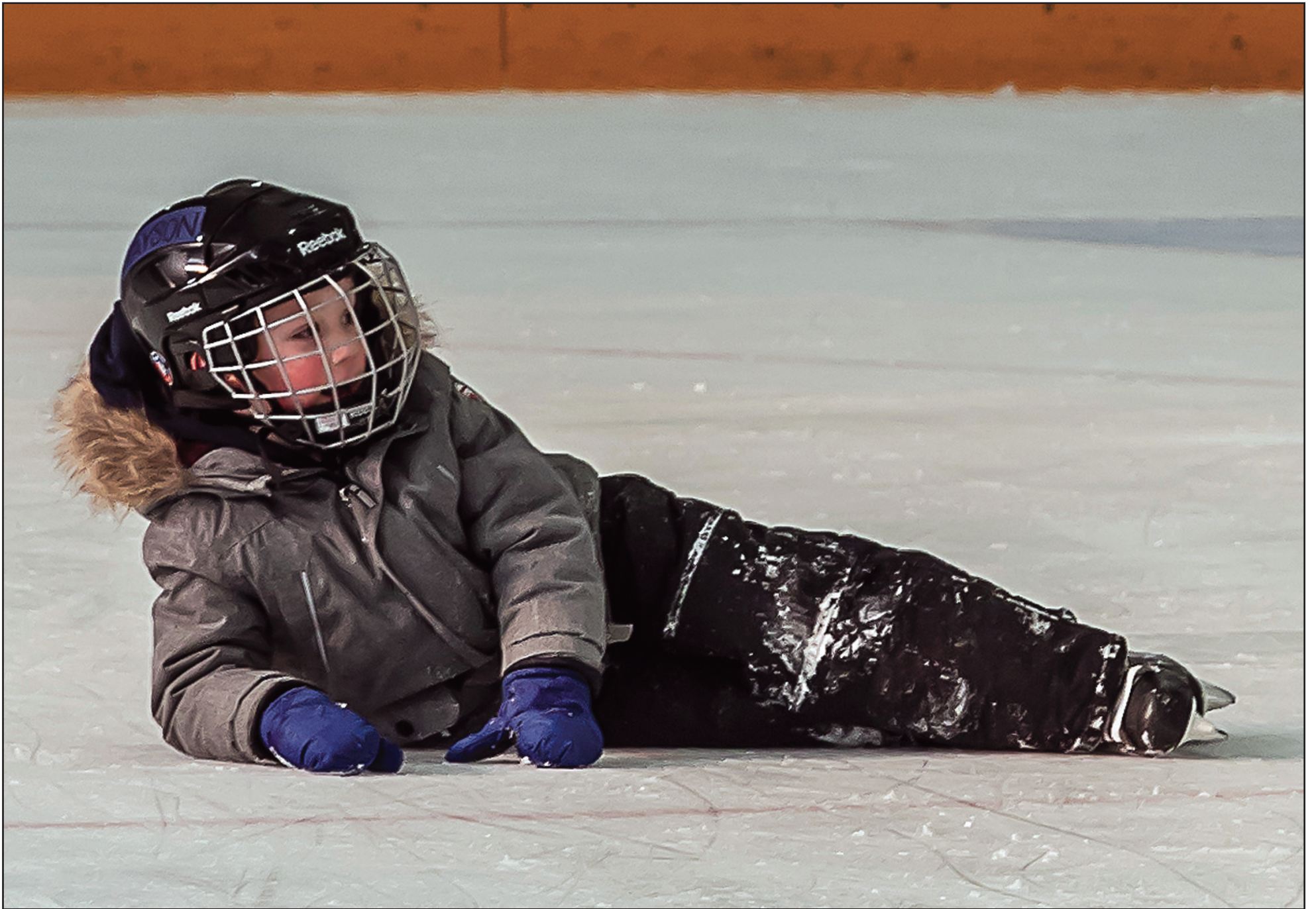
SKATING IS TIRING: Enjoying a PA Day at the Acton arena on Friday could be a tiring job. But there were no shortage of volunteers.