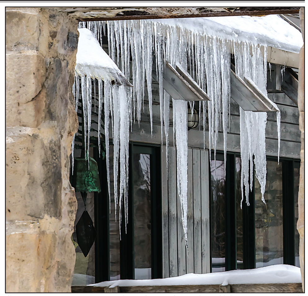
CHILLY: The weather has be ideal for the formation of icicles on the old mill in Eden Mills.