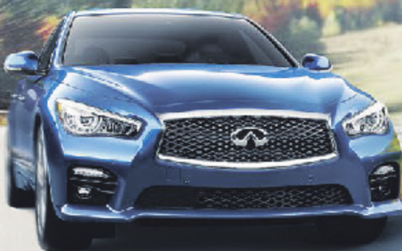
2017 Q50 RED SPORT AWD

0% *LEASE or FINANCE UP TO 48 MONTHS OR ^$7,000 RED SPORT CASH