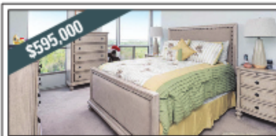
$595,000 PENTHOUSE VIEWS: ROSSEAU UNIT 20 MCFARLANE DRIVE UNIT # 1706 The layout of this rarely offered Rosseau unit, especially the open concept living/ dining area make it a convenient and spacious choice for those who enjoy large gatherings & entertaining. Enjoy Executive living lifestyle on the 17th floor with 2 bedrooms and 2 bathrooms. Hillsteam.ca