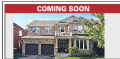
COMING SOON RAVINE PROPERTY 96 ARBORGLEN DRIVE, GEORGETOWN Located in the Prestigious Arbor Glen neighbourhood with 4 bedrooms and over 3000 square feet of finished living space. Backing onto treed ravine! $1,275,000