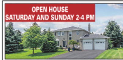
OPEN HOUSE SATURDAY AND SUNDAY 2-4 PM CALEDON COUNTRY CLASSIC 2 BLUE HORIZON COURT, CALEDON 4 bedroom, 4 bathroom home, updated top to bottom with contemporary flair! Wonderful, landscaped property with inground pool, pool house, cabana and multi level deck. Entertaining is made easy here! $929,000 CaledonListings.ca