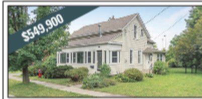
$549,900 LAKESIDE VIEWS ON A DOUBLE MATURE LOT! 87 LAKE AVENUE Family living backing onto Prospect park and across from Fairy Lake. Enjoy this 3 bedroom home with main floor family room, walkout to private mature yard with entertainment sized deck and hot tub area. Actonlistings.ca