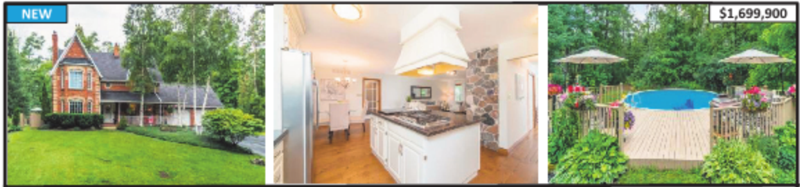
NEW $1,699,900 COUNTRY CLOSE TO TOWN! Resort-Like Property, 22.65 Acres. Featuring 3200 Sq. Ft., 5 Bedroom Home! Hardwood Floors Throughout, Upgraded Kitchen!