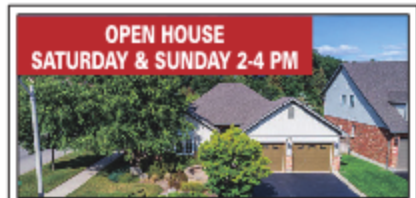
OPEN HOUSE SATURDAY & SUNDAY 2-4 PM RARE BUNGALOW IN DESIRED NEIGHBORHOOD! 1 COSTIGAN COURT Beautifully maintained, updated & appointed bungalow. Cathedral ceilings, open concept with 3 main floor bedrooms. Finished on both levels with distinction. Landscaped premium lot! $1,055,000 GeorgetownBungalow.ca