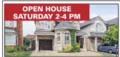
OPEN HOUSE SATURDAY 2-4 PM FULLY FINISHED WITH FIVE BEDROOMS! 1227 ROBSON CRESCENT, MILTON There's room for everyone in this family functional home. Spacious and bright on all levels. Lower level with separate living area. $815,000 MiltonHome4U.com