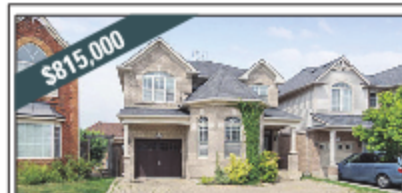
$815,000 FULLY FINISHED WITH FIVE BEDROOMS! 1227 ROBSON CRESCENT, MILTON There's room for everyone in this family functional home. Spacious and bright on all levels. Lower level with separate living area. MiltonHome4U.com