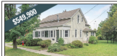
$549,900 LAKESIDE VIEWS ON A DOUBLE MATURE LOT! 87 LAKE AVENUE Family living backing onto Prospect park and across from Fairy Lake. Enjoy this 3 bedroom home with main floor family room, walkout to private mature yard with entertainment sized deck and hot tub area. Actonlistings.ca