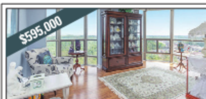
$595,000 PENTHOUSE VIEWS: ROSSEAU UNIT 20 MCFARLANE DRIVE UNIT # 1706 The layout of this rarely offered Rosseau unit, especially the open concept living/ dining area make it a convenient and spacious choice for those who enjoy large gatherings & entertaining. Enjoy Executive living lifestyle on the 17th floor with 2 bedrooms and 2 bathrooms. Hillsteam.ca