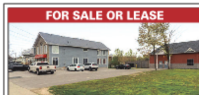
FOR SALE OR LEASE 3 PARCEL PACKAGE: ONE ADDRESS 106 GUELPH STREET, GEORGETOWN Wow rare opportunity abounds with great exposure for your business. Building with versatile office space and residential apartment plus tons of parking! $1,399,999 HillsTeam.com