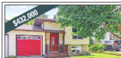
$432,000 79 QUARRY DRIVE, ORANGEVILLE Versatile living space in this semi detached home with legal apartment. 1 bedroom on the upper level, 2 bedrooms on the lower level. Walkout to deck & mature backyard from upper level. Indoor access to garage.