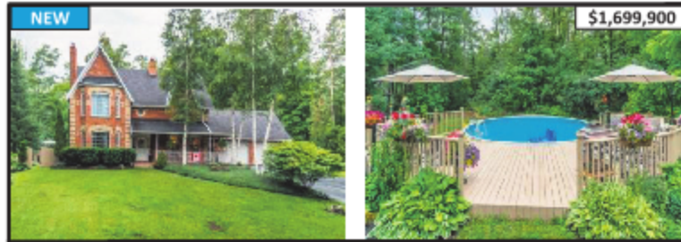
NEW $1,699,900 COUNTRY CLOSE TO TOWN! Resort-Like Property, 22.65 Acres. Featuring 3200 Sq. Ft., 5 Bedroom Home!