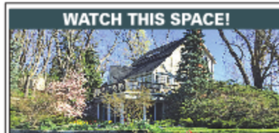
WATCH THIS SPACE! CALEDON COUNTRY ESTATE COMING THIS SEPTEMBER!