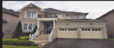
9 EAGLELANDING DR, BRAMPTON SUNDAY, AUG 13 2:00-4:00PM $899,900 - NEW MICHELLE BELL*