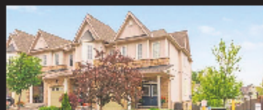
38 SUTCLIFF LANE, GEORGETOWN SUNDAY, AUG 13 2:00-4:00PM $624,900 - W3888155 NUSHIA MATHESON*