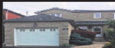
5 MCKINNON AVE, GEORGETOWN SUNDAY, AUG 13 2:00-4:00PM $649,000 - NEW BROCK GONCHAR*

TEL: 905-877-8262 TOLL FREE: 1-866-865-8262