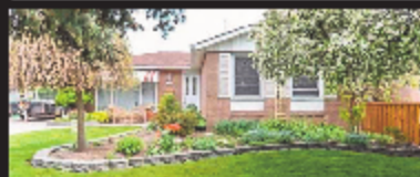
52 FLAVIAN CRES, BRAMPTON SATURDAY, AUG 12 2:00-4:00PM $639,000 - W3857322 DEBORAH PIERCE*