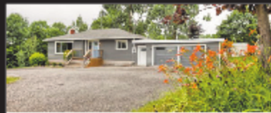
8952 WELLINGTON RD 22, ERIN SAT, AUG 12 & SUN, AUG 13 2:00-4:00PM $749,900 - X3861914 MIMI KEENAN*