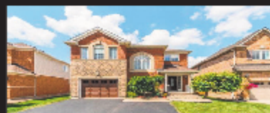
55 BELMONT BLVD, GEORGETOWN SAT, AUG 12 & SUN, AUG 13 2:00-4:00PM $739,900 - W3888360 SILSELLS TEAM