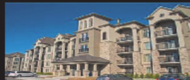
1478 MAIN ST UNIT 413, MILTON SUNDAY, AUG 13 2:00-4:00PM $424,900 - NEW DEBORAH PIERCE*