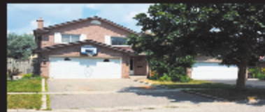
27 CALVERT DR, GEORGETOWN SUNDAY, AUG 13 2:00-4:00PM $619,900 - NEW CHRISTINE MONCKTON*