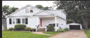
12 OSTRANDER BLVD, GEORGETOWN SUNDAY, AUG 13 2:00-4:00PM $789,900 - NEW THE JOHNSON GROUP