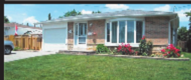
101 IRWIN CRES, GEORGETOWN SATURDAY, AUG 12 2:00-4:00PM $669,900 - W3858620 ROB MCMULKIN*