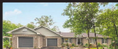
16 MORGAN DR, ACTON SUNDAY, AUG 13 2:00-4:00PM $1,100,000 - W3872700 ROB MCMULKIN*