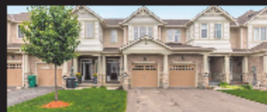
38 KAMORI RD, CALEDON SUNDAY, AUG 13, 2:00-4:00PM $638,000 - W3867385 CHOOSE A CORDINGLEY TEAM