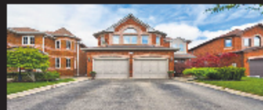
21 CHESTER CRES, GEORGETOWN SAT, AUG 12 & SUN, AUG 13 2:00-4:00PM $874,900 - W3861832 SILSELLS TEAM