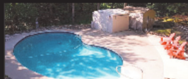
4 PATRICK DR, ERIN SAT, AUG 12 & SUN, AUG 13 2:00-4:00PM $975,000 - X3834312 THE LATAM TEAM