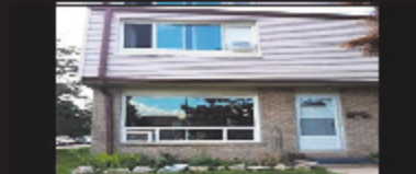
46 MOUNTAINVIEW RD 5 UNIT 1, GEORGETOWN SAT, AUG 12 & SUN, AUG 13 2:00-4:00PM $405,000 - NEW THE MAAN TEAM