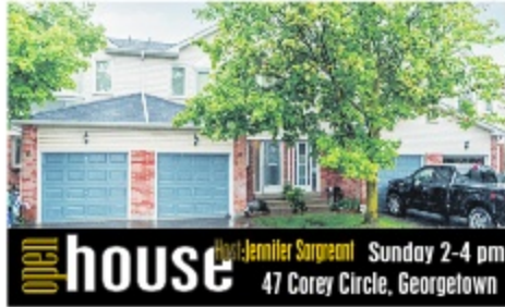
open house Host: Jennifer Sargeant Sunday 2-4 pm 47 Corey Circle, Georgetown

Move In & get comfortable in this 3 bdrm, 2.5 bath townhouse. The foyer with ceramic floor, closet & access to garage, welcomes you into this lovely home. Open concept living/dining room features laminate flooring & fireplace. The kitchen has laminate flooring & pass thru to living room. The upstairs boasts 3 good sized bedrooms, the master with W/I closet, bay window, stylish grey laminate & 4 piece ensuite. The lower level offers a rec room & walkout to patio. $449,900.00 Georgetown MLS# W3817358