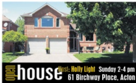
open house Host: Holly Light Sunday 2-4 pm 61 Birchway Place, Acton

Step Inside and be wowed at over 3,000 sq. ft. of exceptionally finished living space with 3 bedrooms, 3 washrooms & 3 walkouts. Stunning open concept main level with living/dining combination, gorgeous chef approved kitchen & spacious family room. Lovely 2nd floor master with W/I closet & 5-pc ensuite. Walkout lower level with rec room, craft/kitchen area, 3-pc bath & loads of storage/utility space. No homes behind - steps to Lake & close to all amenities. $759,900.00 Acton MLS# NEW