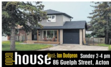
open house Host: Ian Dudgeon Sunday 2-4 pm 86 Guelph Street, Acton

A Real Beauty Inside and Out! Totally redone with style & class! Well set back from the road this 3 bedroom, 2 bathroom home features a lovely interlock walk, front porch & gorgeous entry system. The open concept main level offers pot lights, breakfast bar, beautiful off-white cabinetry & walkout to large deck overlooking mature yard. 2nd floor laundry is a bonus! Finished lower level has a rec room, sitting area & plenty of storage/utility space. Perfect!! $574,900.00 Acton MLS# NEW