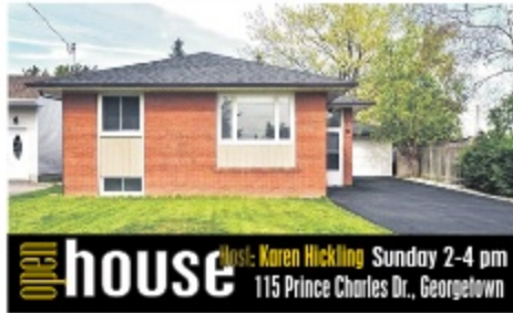
open house Host: Karen Hickling Sunday 2-4 pm 115 Prince Charles Dr., Georgetown

Even Little Legs can walk to the grade school from this 3 bdrm, 1 bath bungalow. Gleaming hardwood in living/dining with pot lights. "Window" into updated kitchen allows you to watch the kids while preparing meals. Main 4 piece bath is retro and nicely updated. Bedrooms all have hardwood and closets. Finished basement offers rec room, 4th bedroom, laundry & great storage. Oversized detached garage! Mature fenced lot and easy walk to shopping & parks. $524,900.00 Georgetown MLS# NEW