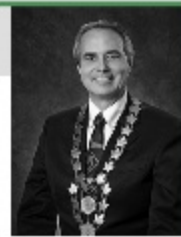
Greg Carr Mayor of Halton Hills

For more information, visit halton.ca/immunize or call 905-825-6000 x399.