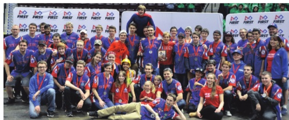
Members of Team 4976, the GDHS Rebels, had one of the final robots left standing at last weekend's FIRST World Championships in St. Louis, Mo., out of 400 entries. Rebellion II bowed out to the eventual winners in the finals and ended up with a top-10 finish in the school's first-ever trip to the global event.