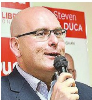
STEVEN DEL DUCA