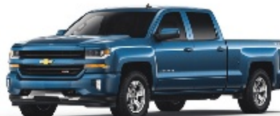
SILVERADO 1500 LT 271 CREW CAB MODEL SHOWN

CHEVROLET HAS EARNED MORE 2016 J.D. POWER AWARDS IN INITIAL QUALITY THAN ANY OTHER BRAND.