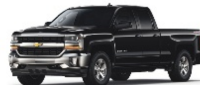
SILVERADO 1500 LT DOUBLE CAB TRUE NORTH EDITION MODEL SHOWN