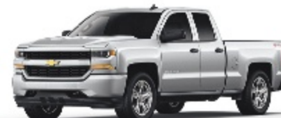
SILVERADO 1500 DOUBLE CAB CUSTOM EDITION MODEL SHOWN