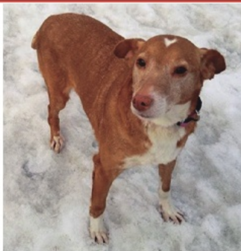
Seven-year-old Faye gets spooked easily and would do well in a home without children.