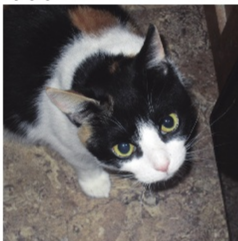
One-year-old Pandora is eager to join her new family.