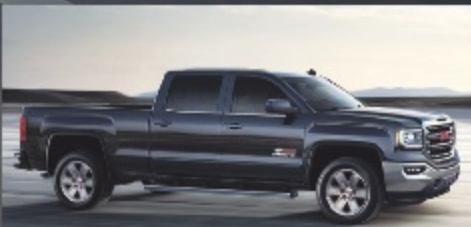
2017 SIERRA KODIAK CREW CAB SHOWN