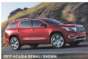
2017 ACADIA DENALI SHOWN