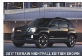
2017 TERRAIN NIGHTFALL EDITION SHOWN

WHEN EQUIPPED WITH THE OPTIONAL DRIVER ALERT PACKAGE