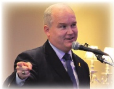
Erin O Toole

Third, let's re-invent a new government for a new era. Every program should be under review.