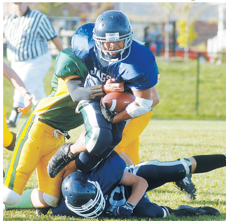
The Catholic board announced last Thursday that beginning in September, its nine schools will compete in the newly formed Halton Catholic Athletic Association.

"Sometimes these things have a way of inspiring people to make it even better," he said.