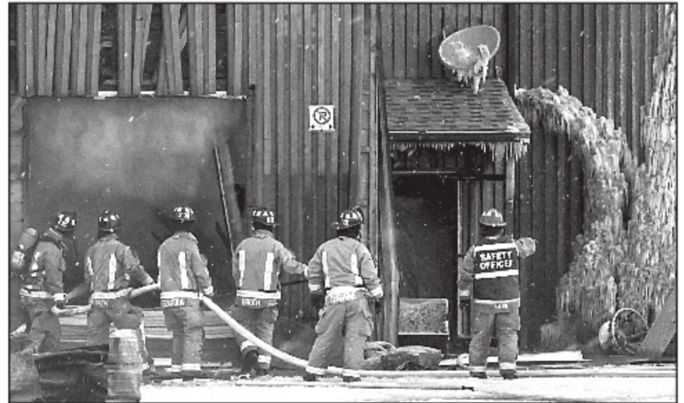
Scene at the recent Commercial building fire on Hwy 7.

In fact, since there is zero possibility of the usual human activities being a cause—faulty wiring, careless smoking, cooking, heating etc.—and since there haven't been any lightning events during any of the recent fires, there are few items left on the list that could initiate such an event. Investigators can look for evidence of an accelerant, or a pattern to the