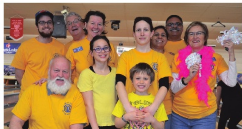
Optimist Club of Halton Hills members get their game on during the Mayor's Bowl-A-Thon for Big Brothers Big Sisters.