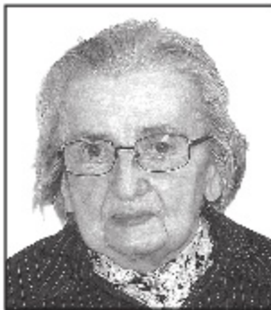
DYRIW: May 1928 – 2017

MacKinnon Family Funeral Home (519) 853-0350 or 1-877-421-9860 (toll free)