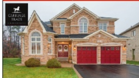
41 Olivia Marie Road, Brampton

OPEN HOUSE - Saturday, Dec. 10 from 12-4 PM