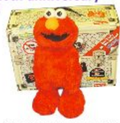
10th anniversary Tickle Me Elmo

Telephone bids are not accepted Call the Thrift Shop for details 905.702.8661 All money raised helps the animals at the shelter