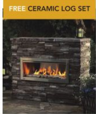
FREE CERAMIC LOG SET