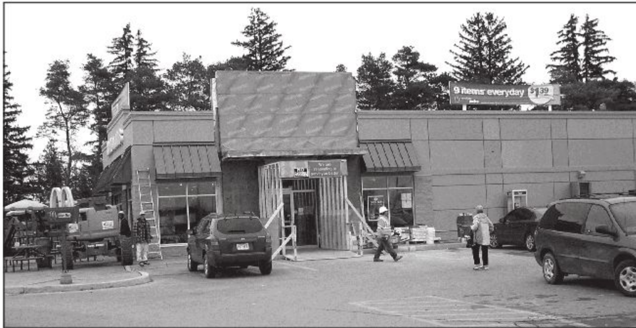
ARCH APPEAL: The interior refurbishment at the Acton McDonald's should be wrapped up next week, and the major exterior work – a brand new corporate look – is also almost complete.