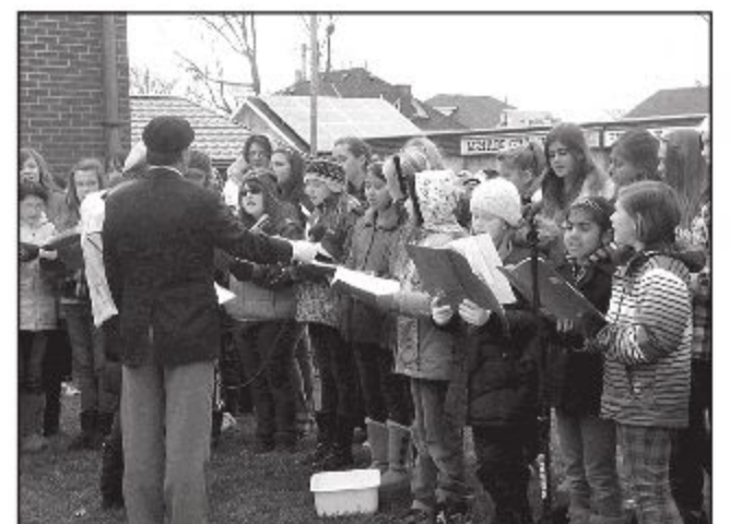
St. Joseph School Choir