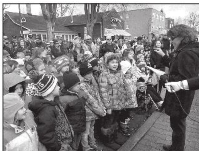
Robert Little School students