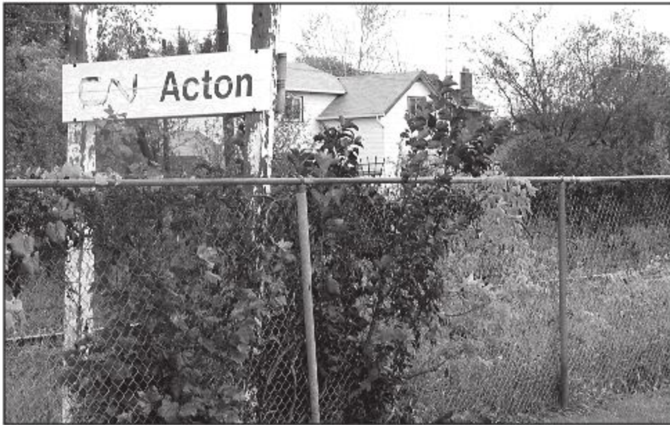
GO ACTON: By the end of the year, GO Transit expects to begin GO Train service to Acton. GO officials are negotiating with the Town to use municipal property at the tracks for a ticket kiosk and parking.