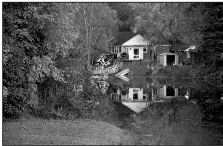
FAIRY LAKE BLESSING