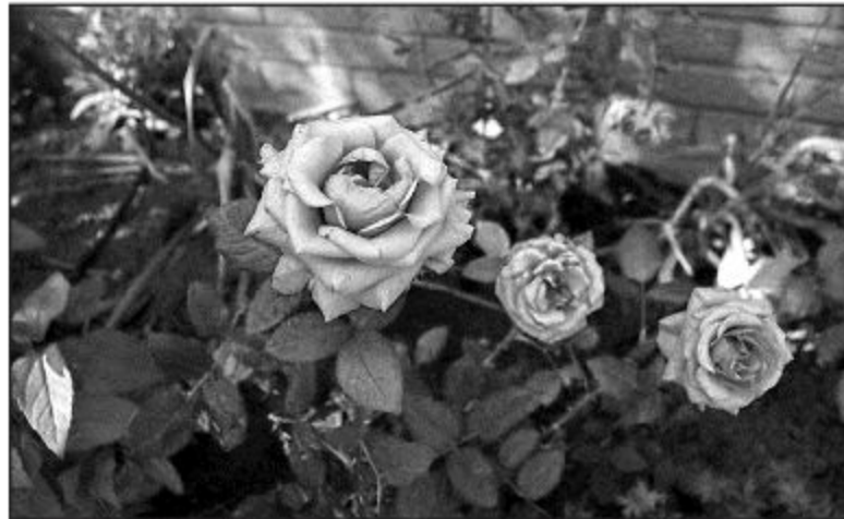
LATE BLOOMERS: The recent warm weather has allowed a longer blooming time for these beautiful roses

Copies are available at both branches of the library, and you can download a e-copy to your e-reader by visiting www.downloadcentre.library.on.ca