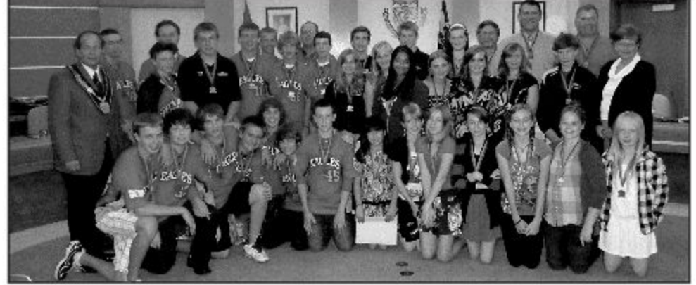
ACE ATHLETES: Local athletes whose accomplishments on the local, provincial and national scene were honoured by the Town at a Municipal awards ceremony on Monday at the Civic Centre.

St. Joseph Catholic School at 11:33 last Wednesday morning to find out that a small child had pulled the fire alarm and their help was not needed.