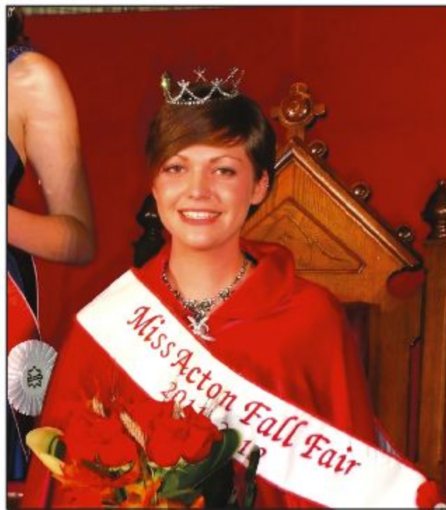
Jessica Watson