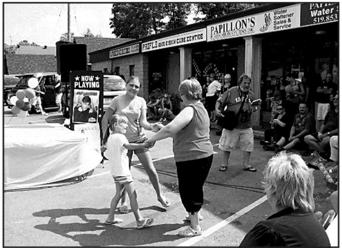
DANCING IN THE STREETS: The sweet sounds and compelling beat of tribute performers – including Johnny Cash, Michael Jackson, and Justin Bieber – got people out of their seats to move to the music on Sunday at Acton's Leathertown Festival.

If you haven't been contacted, call 905-877-3066. The 25th anniversary President's Ball is September 17, at The Club at North Halton Golf Club.