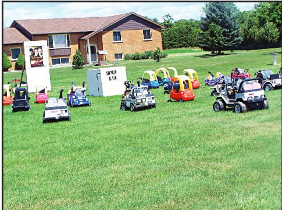
WAITING FOR SUN DOWN: It's time for the geese to catch the latest Harry Potter flick at the drive in. The screen is big and high so they won't have to strain their necks which raises the question: Why is that pair parked all the way at the back by themselves?

In compliance with the Town's new Green checklist, the developer will build housing with an elevated environmental performance, incorporating features which exceed the Ontario Building Code.