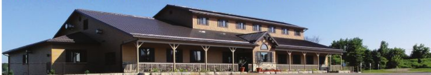
New Knapp's Country Market with 14,000 square feet shopping & dining space

For latest Knapp's promotion & activities, follow us on: We love bus tours and groups, contact us for more information