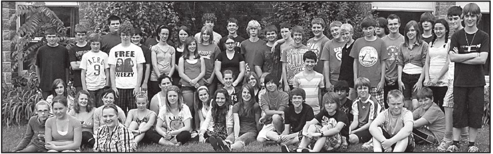
ROCKWOOD CENTENNIAL: The Grade eight class at Rockwood Centennial School celebrated their graduation last week – looking forward to a bright future.