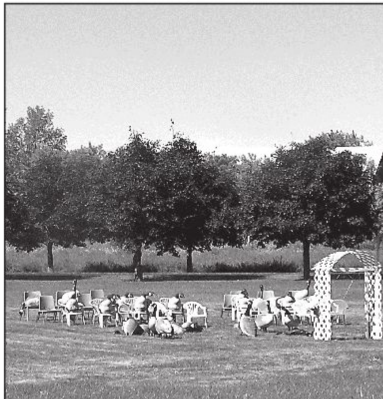
FEATHERED FESTIVITIES: There was webbed and wedded bliss recently as the Rockwood geese celebrated the nuptials of a goose and gander, much to the delight of area residents and passing motorists.