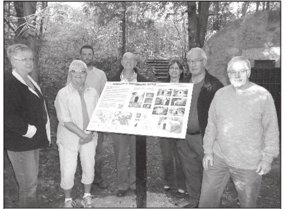
SIGN UNVEILING: Members of the Limehouse Kiln Society and guests posed with a new interpretive sign at the site of a restored Powder Magazine in Limehouse last Wednesday.

She said in the past two years the Society has been available for walking tours for Girl Guides, a cycling club and a group of retired