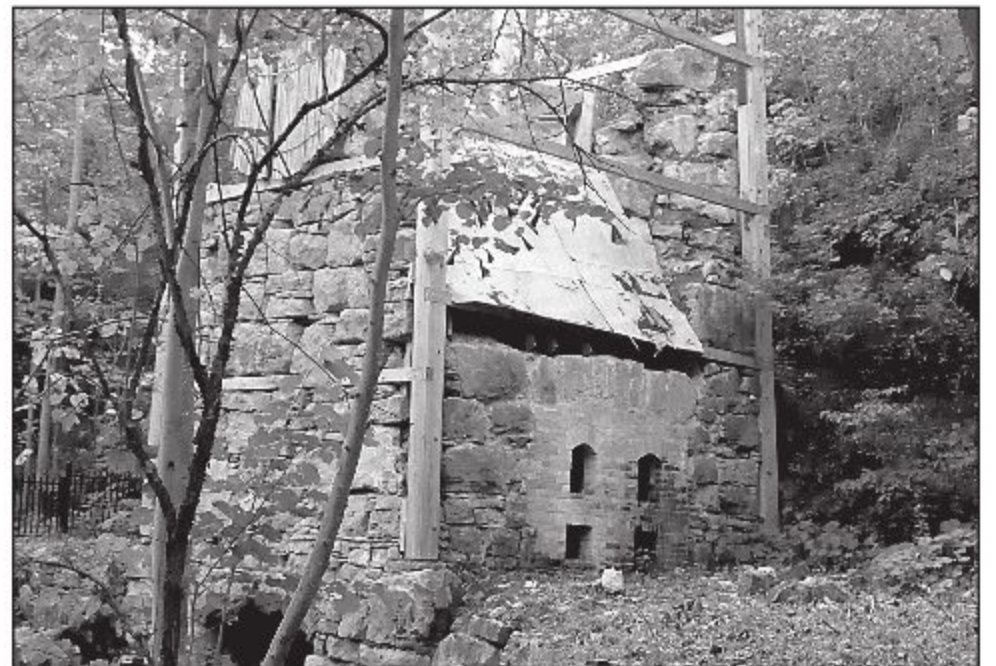
Draw kiln