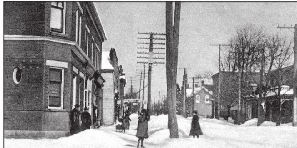
THEN: Mill St. in Winter