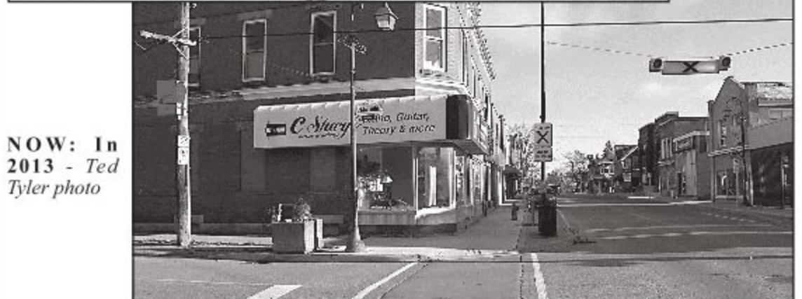
NOW: In 2013

The bank vault door, possibly from the 1890s when this building at 45 Mill St. East housed the Merchants Bank is still in the basement of the building, which today houses a music studio, an accounting office and upstairs apartments.