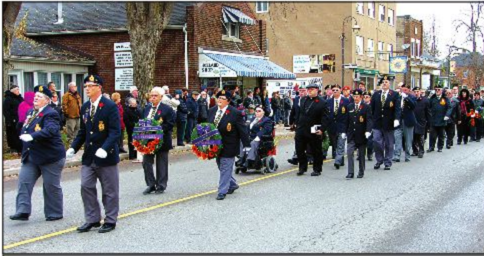
HONOURING VETERANS: Members of the Royal Canadian Legion Branch 197 marched to the Acton Cenotaph for a Remembrance Day service on Saturday.