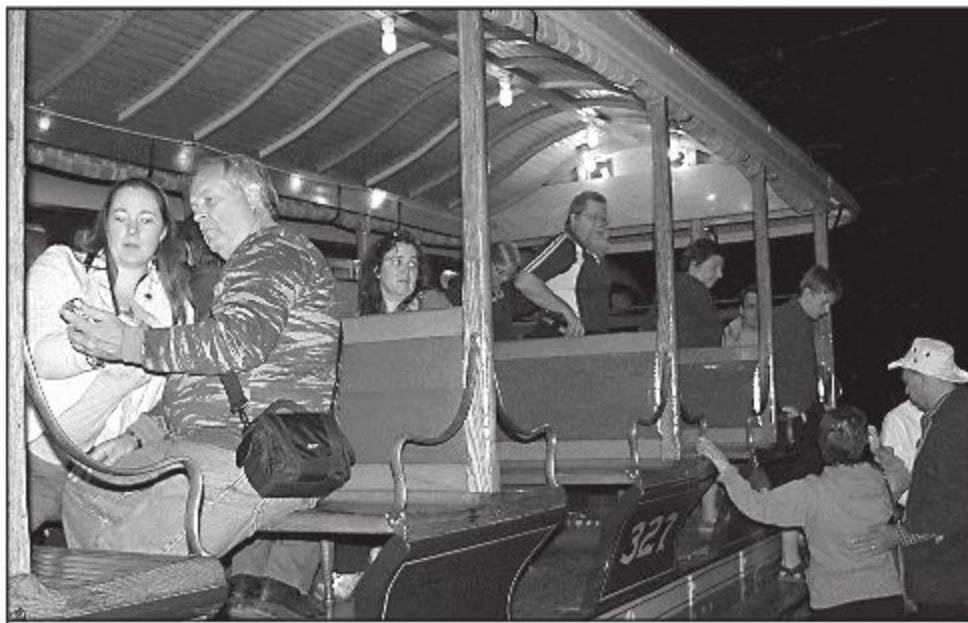
ALL ABOARD: Under the stars, riders enjoyed ice cream and rode the rails on Saturday night at the Halton County Radial Railway.

No one spoke for or against the proposed annexation at the Guelph / Eramosa Township council meeting on Monday.