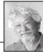
By: David Suzuki

As Oil Change International says, "If you're in a hole, stop digging."