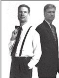
Where friends gather...

Gilbert MacIntyre and Son Funeral Home - Hart Chapel 1099 Gordon Street. Guelph, ON N1G 4X9 519-821-5077