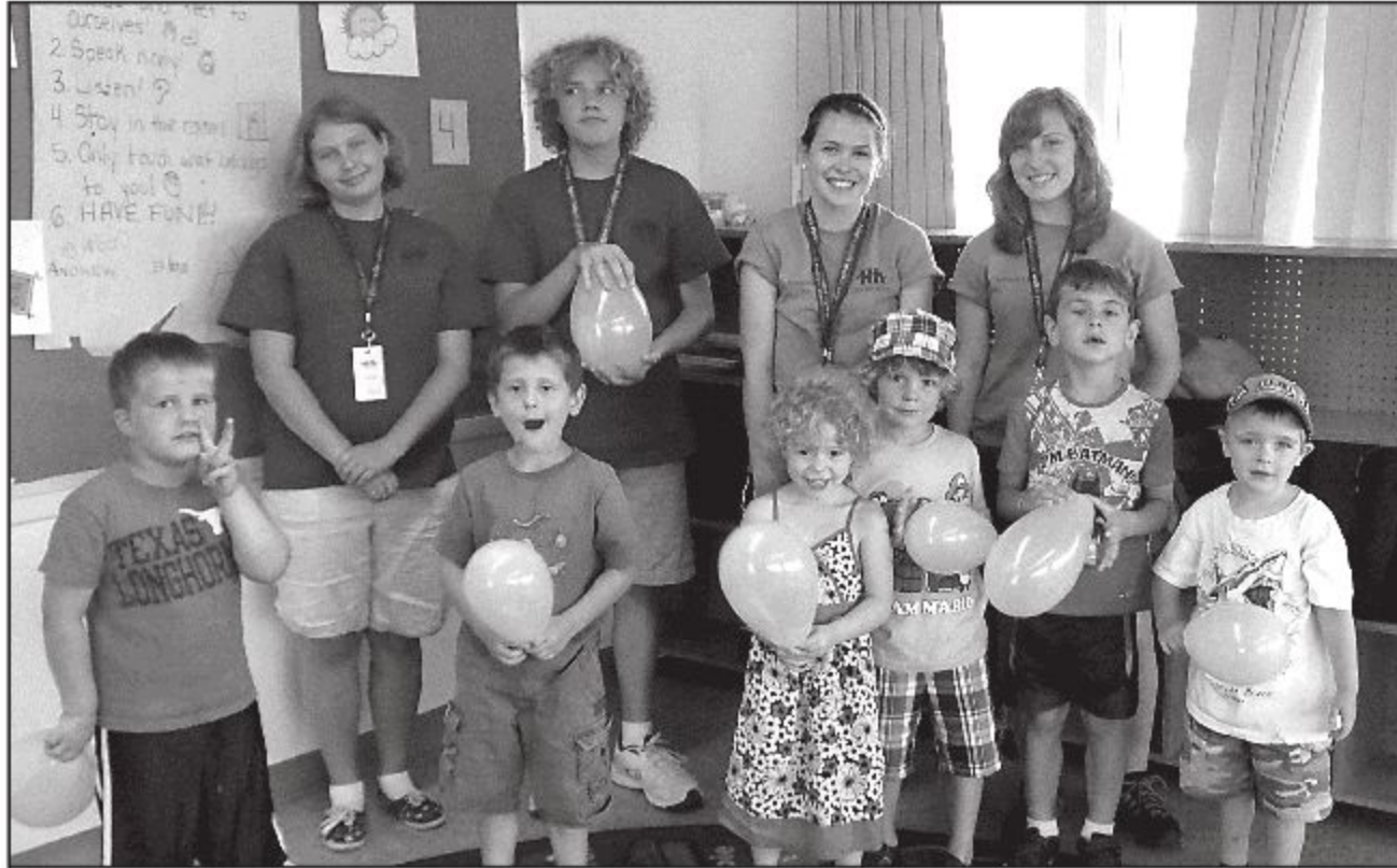
TINY TYKES: Balloons were part of the fun for campers at the Town's Tiny Tykes Sports camp, offered at the Boathouse in Prospect Park.