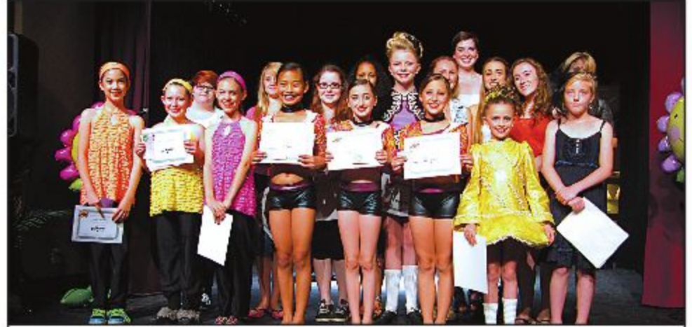
TALENTED TROOP: Music and movement filled the stage at the Town Hall Centre on Saturday for the Acton BIA-sponsored Acton's Got Talent contest featuring 14 acts. The judges selected six acts to vie for the title during Canada Day festivities.

All competitors received certificates and $10 in BIA bucks.