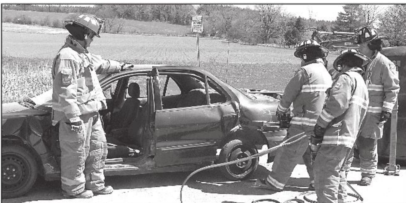
EXTRICATION EXERCISE: Using the Jaws of Life, Guelph/Eramosa firefighters showed how they can save lives during an open house on Saturday at the Rockwood fire hall.