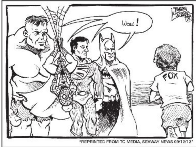
*REPRINTED FROM TC MEDIA, SEAWAY NEWS 09/12/13*

However, all joking and sarcasm aside, I was pretty stoked about reading about the Royal pregnancy. When Prince George was born it was like an angel came down and filled the world with happiness and truly happy front page newspaper photos instead of war, crime, doom and gloom. Do you remember how exciting it was to see picture of William and Harry as kids and when they visited Niagara Falls? Pictures and news like that is what the world needs more of. Congratulations to the Duke and Duchess and of course, Prince George.